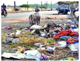
Road/ Highway Embankment