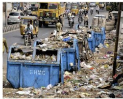
Overflowing dumping bins