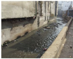
Lakes/Canals & Nalas embankment