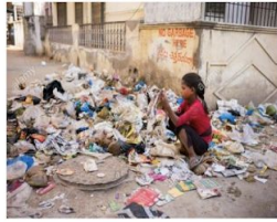
Blackspots & vulnerable dumping spots